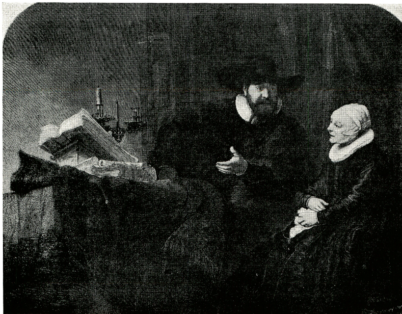
Anso and Widow—Rembrandt